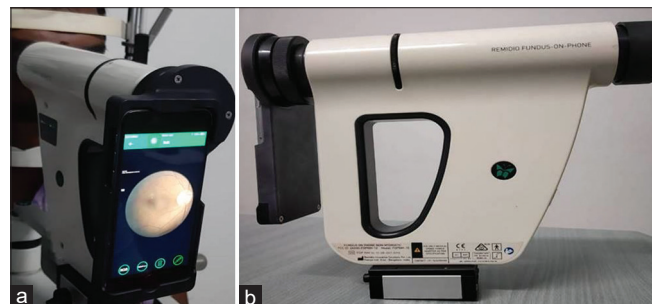
Figure 1: (a and b) Remedio fundus on phone nonmydriatic camera

to media opacities such as dense cataract or total vitreous hemorrhage); Grade 1-poor (only gross retinal changes detectable such as hemorrhages and dense hard exudates); Grade 2-satisfactory (major retinopathy details visible; minor degrees of retinopathy and subtle new vessels not clearly detectable); Grade 3-good (most of retinopathy changes clear and detectable); Grade 4-excellent (lesions clearly visible)